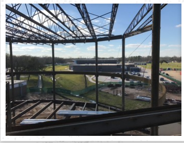
Brazoswood Phase 3 - High School