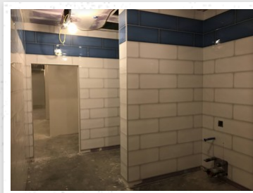
Brazoswood Phase 2 - CTE Building