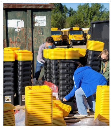
NHS Students setting up to fill Classroom Emergency Buckets

Emergency Response Buckets for the classrooms and Emergency Response Bags for the buses were assembled by the Brazoswood National Honor Society Members. The items included in the emergency kits are flashlights, whistles, Neon vests, First Aid Kits and Emergency blankets. 400 "Go buckets" were placed in classrooms and 73 "Go bags" were placed in the new bus fleet. The Buckets and bags were distributed over the holiday break. Phase 2 of the project will be to deploy Stop the Bleed Kits to the remaining 700 classrooms in the coming weeks.