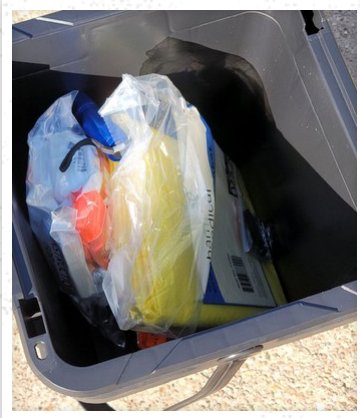
Supplies to fill Emergency Buckets and Bags