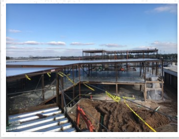
Brazoswood Phase 3 - High School