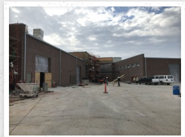
Brazoswood Phase 2 - CTE Building