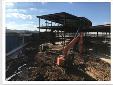
Brazoswood Phase 3 - High School